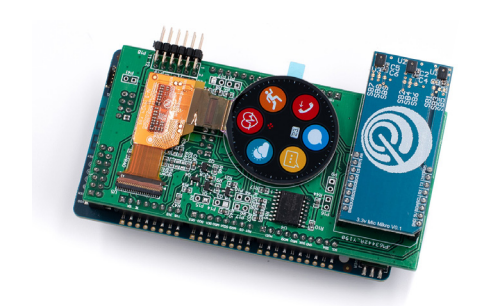
Apollo Graphical Display