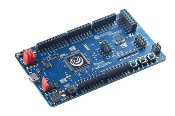
Apollo3 Blue AMA3BEVB (EVB)